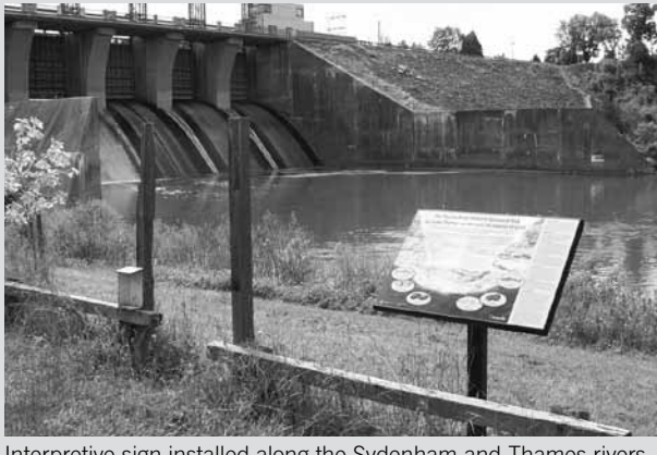
Interpretive sign installed along the Sydenham and Thames rivers in Ontario

Warning sign posted at the Sydenham River, Ontario