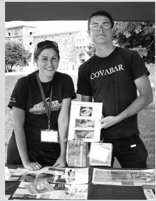
Outreach booth in front of Fort Chambly, near the Richelieu River.

Using a species identification key, officers meet with anglers to help them distinguish between the Copper Redhorse and other fish they catch and to raise their awareness of the importance of conserving the Copper Redhorse. During the summer of 2009, these efforts reached 1450 recreational boaters. As well, COVABAR officers observed 200 violations and helped release 16 redhorses and chub, pursuant to the ban on redhorse fishing in the preserve and to the Quebec Fishery Regulations . This outreach activity, together with the Vianney–Legendre fish ladder at the Canalde-Saint-Ours National Historic Site (see section 6.1), represents an important step towards the recovery of the Copper Redhorse.