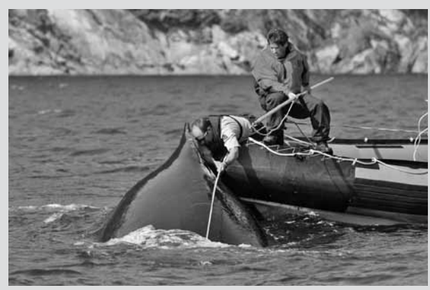
Humpback Whale being disentangled off the coast of British Columbia

Through the formal establishment and funding support of the Marine Mammal Response Program, Fisheries and Oceans Canada is able to work with outside organizations in each region to help minimize threats to marine mammals and sea turtles. Specifically, the national program provides the organizational framework for partnerships and agreements that assist in tracking and responding to marine mammals and sea turtles in distress