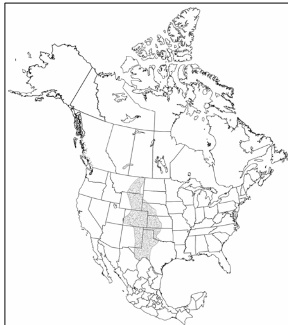
Figure 4. Known range of tiny cryptanthe in North America (adapted from Alberta Sustainable Resource Development 2004).

Globally, tiny cryptanthe is ranked as demonstrably secure under present conditions (G5) (NatureServe 2004).