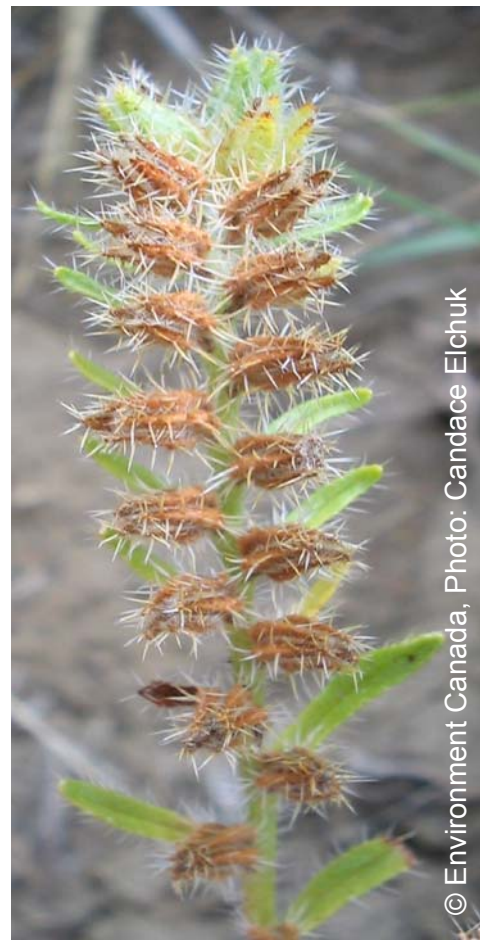
Figure 2. Photo of mature tiny cryptanthe, showing the brown calices.

Tiny cryptanthe is native to North America. In Canada, its known locations are 28 populations 1,2 in Alberta and four populations in Saskatchewan (Alberta Sustainable Resource Development 2004; C. Bradley pers. comm.; C. Elchuk pers. obs.; D. Nernberg pers. obs.) (Figure 3, Table 1). Tiny cryptanthe is associated with river systems, mainly the South Saskatchewan River valley in the eastern half of Alberta and near the western border of Saskatchewan. Tiny cryptanthe has also been found in the vicinity of the lower Bow and upper Oldman rivers in Alberta and the Red Deer River in Saskatchewan. The nearest location in the United States is in Montana, 450 km from the southernmost Alberta location (Alberta Sustainable Resource Development 2004). The number of populations in the United States is not documented; it is not known what percentage of the species' global distribution and abundance is currently found in Canada, although it is undoubtedly small (Figure 4). There are insufficient historical and long-term data collected for this species to allow a rate of population decline to be determined.