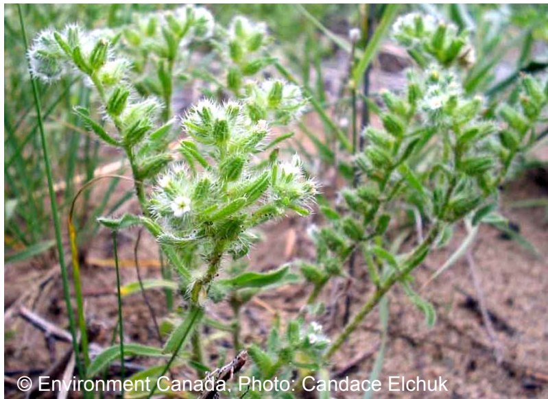
Figure 1. Photo of tiny cryptanthe plant with flowers.

Tiny cryptanthe ( Cryptantha minima Rydb.) is an annual species in the Borage family (Boraginaceae). The bristly-haired stems are branched from near the base and grow up to 10–20 cm high. The leaves, also bristly-haired, are spatula-shaped and can be up to 6 cm long by 0.5 cm wide at the base of the plants, but get smaller as they proceed up the stem (Moss 1994). Tiny cryptanthe flowers from late May to early July (Smith 1998; Kershaw et al. 2001; Alberta Sustainable Resource Development 2004). The flowers are tube-shaped, with white petals and yellow centres, and are arranged along the top side of the branches (Figure 1). At the base of each flower is a small leaf, or bract. The flowers are up to 2 mm across and 3 mm long. Bristly, green sepals with thickened, whitish midribs surround the flower petals, forming a calyx (Figure 1).