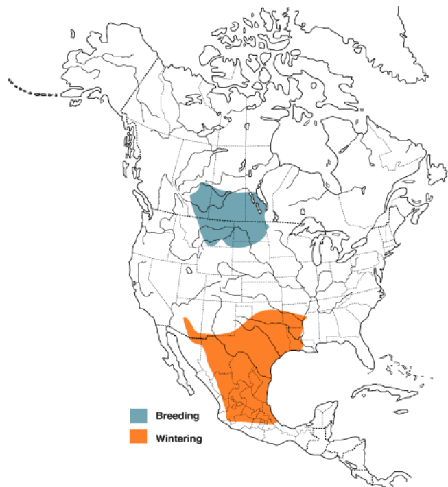
Figure 1. Distribution of the Sprague's Pipit in North America (from Robbins and Dale 1999).

The Sprague's Pipit is endemic to North America, where it breeds from the foothills of the Rocky Mountains in southern and central Alberta to southwestern Manitoba and south to southern Montana, northern South Dakota, and northwestern Minnesota (Figure 1; Robbins and Dale 1999). A single breeding record was recorded in the Riske Creek area of south-central British Columbia in 1991 (McConnell et al. 1993). The breeding range of the Sprague's Pipit in Canada has contracted from the eastern and northern portions of its historic range in each of the three provinces (COSEWIC 2000). Overall, 60% of the continental breeding range of the Sprague's Pipit occurs in Prairie Canada (CPPF 2004). Pipits winter in the southwestern United States (primarily Texas, Louisiana, Oklahoma, New Mexico, and Arizona) and northern Mexico (Robbins and Dale 1999).