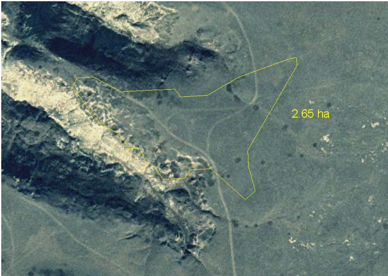
Figure 3. Range of soapweed at the Pinhorn Site.