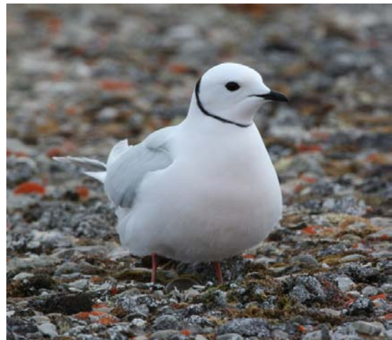
Figure 1. Ross's Gull ( Rhodostethia rosea ) © Her Majesty the Queen in Right of Canada (Mark Mallory, Environment Canada).

Their nests can be a depression in the ground or a moss cup, or they can be located in sedge tussocks (Chartier and Cooke 1980; Macey 1981). Ross's Gull eggs are olive with faint reddish-brown markings (Ehrlich et al. 1988) and measure approximately 30 mm × 43-46 mm (Béchet et al. 2000). Clutch size is generally three, but a clutch may contain one or two eggs. Nests are incubated by both parents (Macey 1981) for 21 to 22 days, and chicks fledge at 20+ days after hatch (Chartier and Cooke 1980; Ehrlich et al. 1988). In Canada, chicks hatch approximately mid-July (Macey 1981).