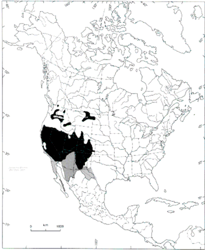
Figure 2. Known North American Range of Apodemia mormo , the Mormon metalmark butterfly. Populations in regions shown in grey were considered another subspecies and were removed from A. mormo range by Opler 1999. Map adapted from Opler 1999 and Pyle 2002 (Taken from COSEWIC 2002).