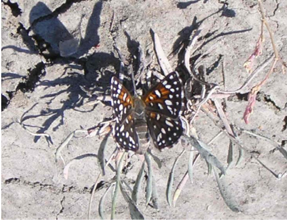
Figure 1. Picture of a Mormon metalmark butterfly on a branched umbrella plant in Grasslands National Park, Saskatchewan, Canada.