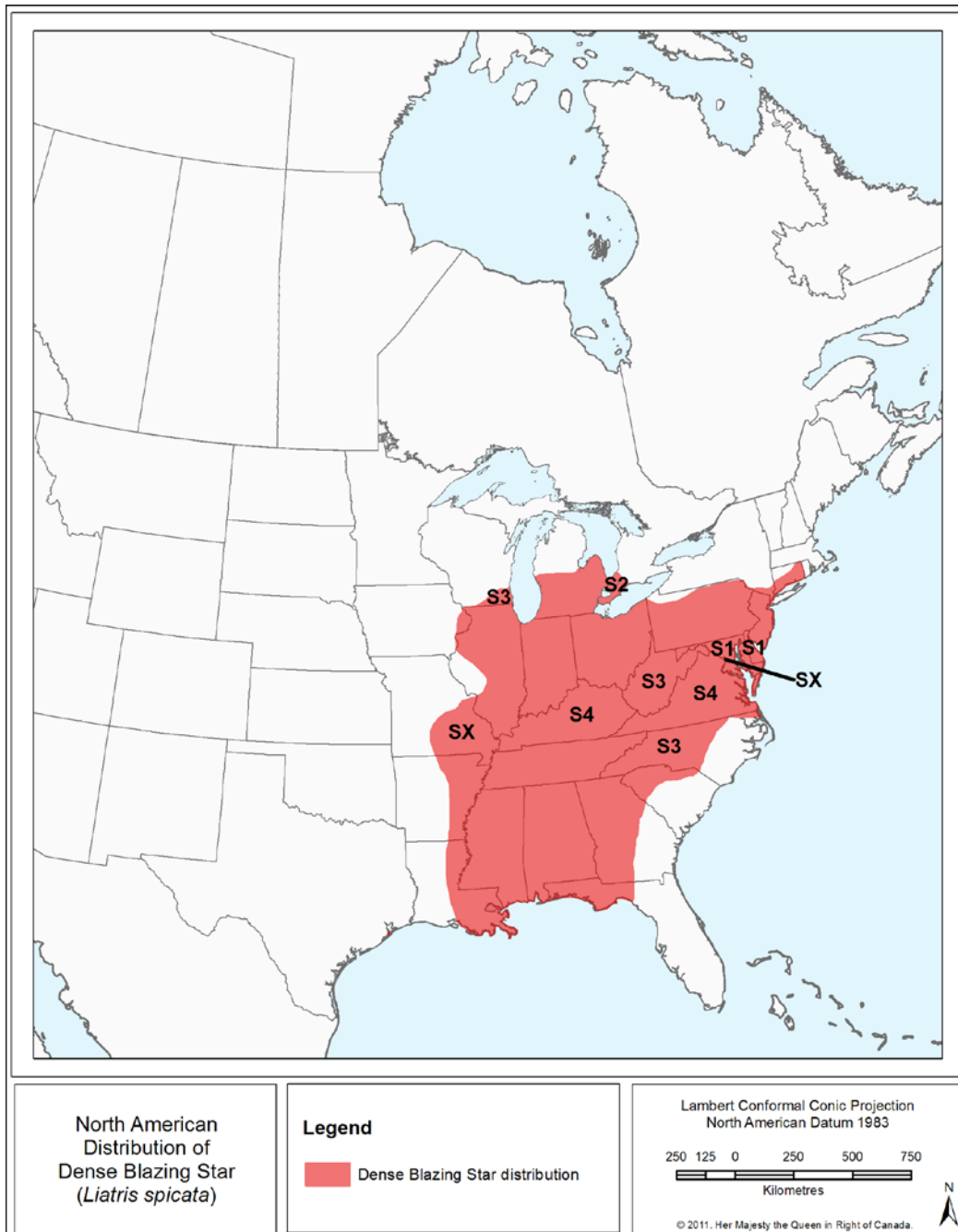
Figure 1. North American Distribution of Dense Blazing Star (range distribution based on Royal Ontario Museum (2011), and subnational (state or province) status ranks based on NatureServe (2011)).