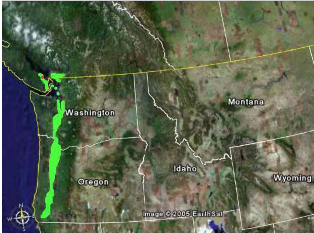
Figure 2. Breeding range of the Vesper Sparrow affinis , shown in light green; Nanaimo airport site shown as red dot. The interior subspecies of the Vesper Sparrow ( P. g. confinis ) breeds in grassland areas shown in the satellite image as a buff colour, separated from the coastal grasslands by high mountains (dark green and white).

In Canada, the Vesper Sparrow affinis is currently known to breed only on Vancouver Island at a single location: the Nanaimo airport, near Cassidy (Beauchesne 2002a, 2003, 2004a).