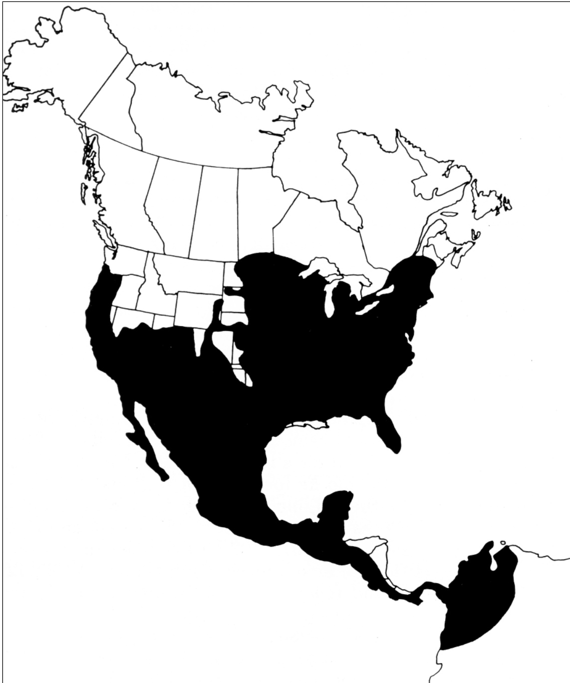
Figure 1. Global range of the Gray Fox (Judge and Haviernick 2002).