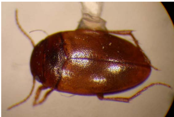
Figure 1. Adult Bert's Predaceous Diving Beetle

been observed. Assuming they are similar to other species of Sanfilippodytes , there are likely three instars, with the first instar being distinct in appearance from later instar larvae (COSEWIC 2009; Alarie and Michat 2014).