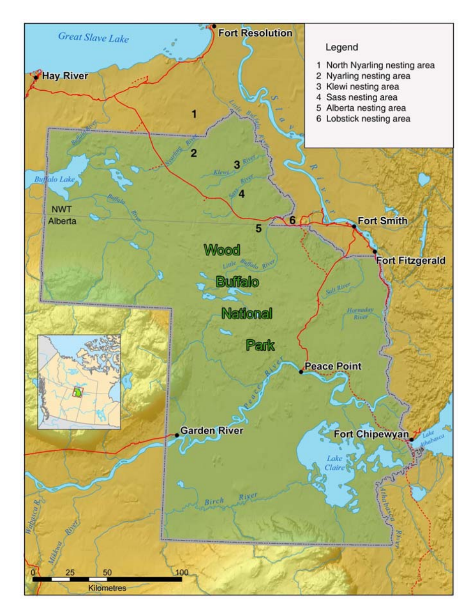
Figure 3. Breeding area of the Aransas–Wood Buffalo Population, Wood Buffalo National Park.

( Typha sp.), sedge ( Carex aquatilis ), musk-grass ( Chara sp.), and other aquatic plants are common (Allen 1956; Novakowski 1965, 1966; Kuyt 1976a, 1976b, 1981). Nest sites are located primarily in shallow diatom ponds that contain bulrush (Timoney 1999).