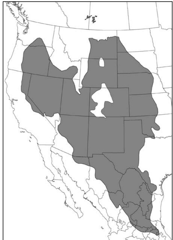
Figure 1. Global distribution map of Ord's Kangaroo Rat (adapted from maps published by NatureServe 2008 and COSEWIC 2006).

The kangaroo rat is widely distributed in the interior arid grasslands and deserts of North America, extending through the Great Plains south to central Mexico (Figure 1). There have been no recent large-scale changes in the geographic distribution of the species, which encompasses approximately 3.37 million km 2 (COSEWIC 2006).