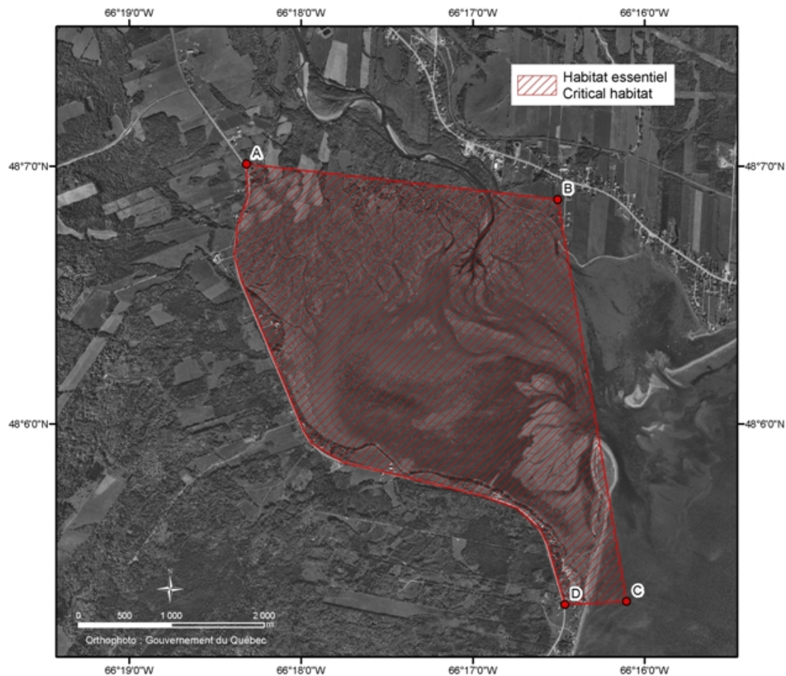
Figure A-1: Location of the site containing critical habitat at Nouvelle. Critical habitat includes all suitable salt marsh habitat (as described in Section 7.1) that occurs within the polygon located in the Nouvelle River estuary. The polygon extends between nodes A, B, C and D and includes salt marsh habitat east of the Miguasha Road and those west of Pointe Labillois.