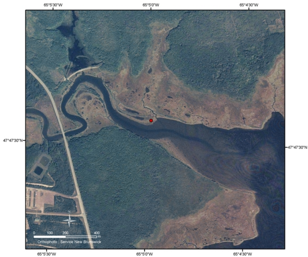
Figure A-9. Location of the site containing critical habitat at Rivière-du-Nord. The dot (·) represents the approximate centre of the site. Within this site, critical habitat includes all suitable salt marsh habitat (as described in Section 7.1).