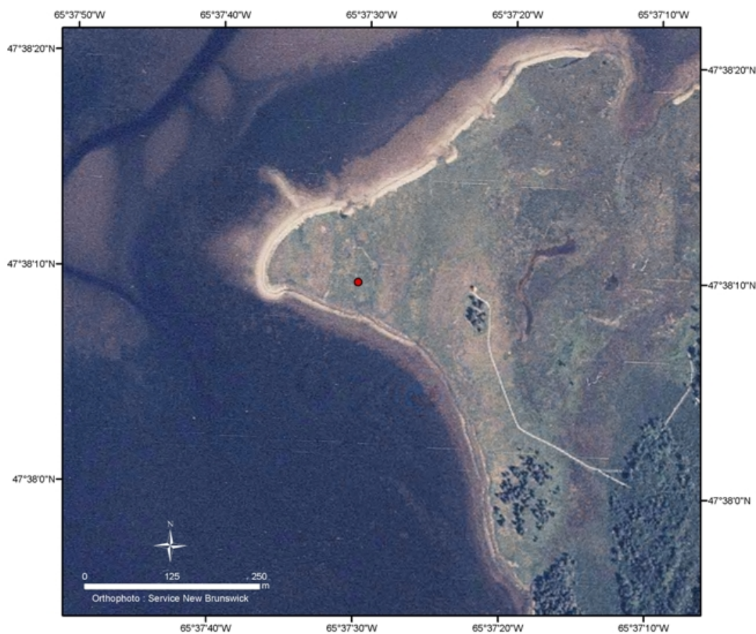
Figure A-5. Location of the site containing critical habitat at Daly Point. The dot (·) represents the approximate centre of the site. Within this site, critical habitat includes all suitable salt marsh habitat (as described in Section 7.1).