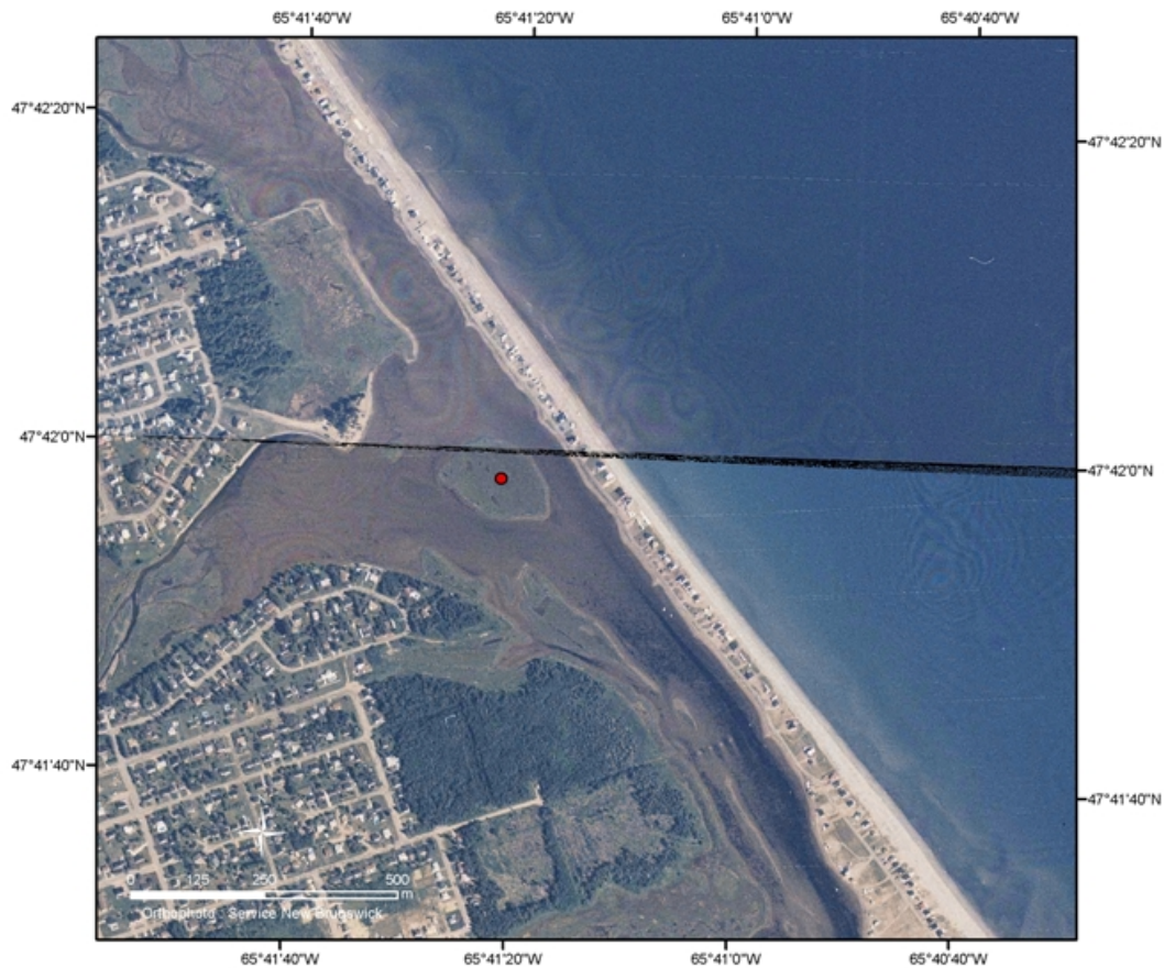
Figure A-4. Location of the site containing critical habitat at Peters River. The dot (·) represents the approximate centre of the site. Within this site, critical habitat includes all suitable salt marsh habitat (as described in Section 7.1).