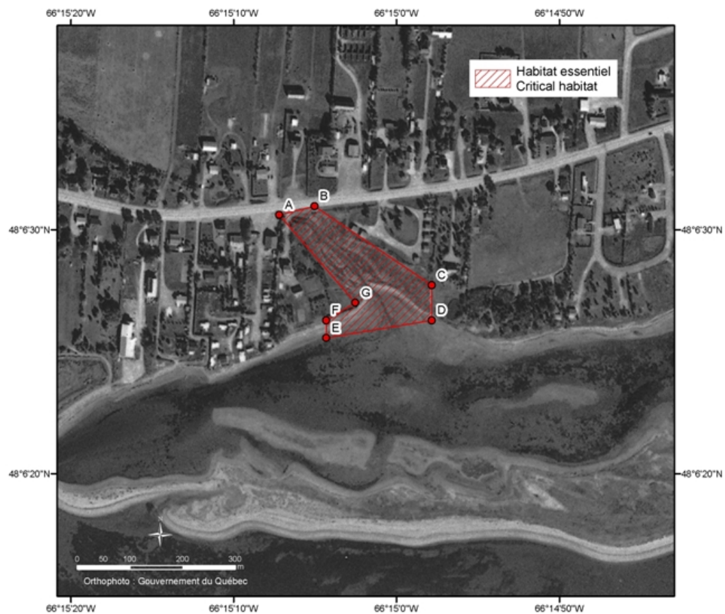
Figure A-2: Location of the site containing critical habitat at Saint-Omer. Critical habitat includes all suitable salt marsh habitat (as described in Section 7.1) that occurs within the polygon located at the mouth of Ruisseau Robitaille (barachois de Saint-Omer), near the village of Robitaille, south of highway 132.