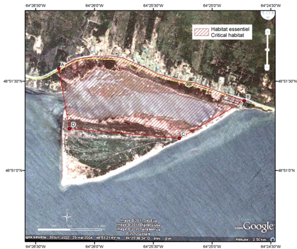
Figure A-3 : Location of the site containing critical habitat at Penouille. Critical habitat includes all suitable salt marsh habitat (as described in Section 7.1) that occurs within the polygon outlined below. The polygon extends between nodes A, B, C, and D in the Baie de Penouille. It covers the area located south of highway 132, to the north of the road located on Presqu'île de Penouille between nodes B, C and D, then northward toward node A.