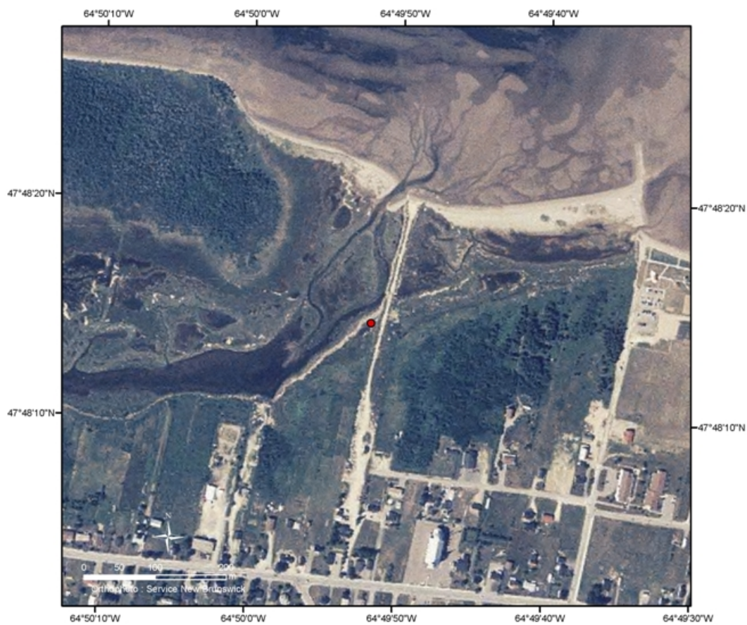
Figure A-8. Location of the site containing critical habitat at Bas Caraquet. The dot (·) represents the approximate centre of the site. Within this site, critical habitat includes all suitable salt marsh habitat (as described in Section 7.1).