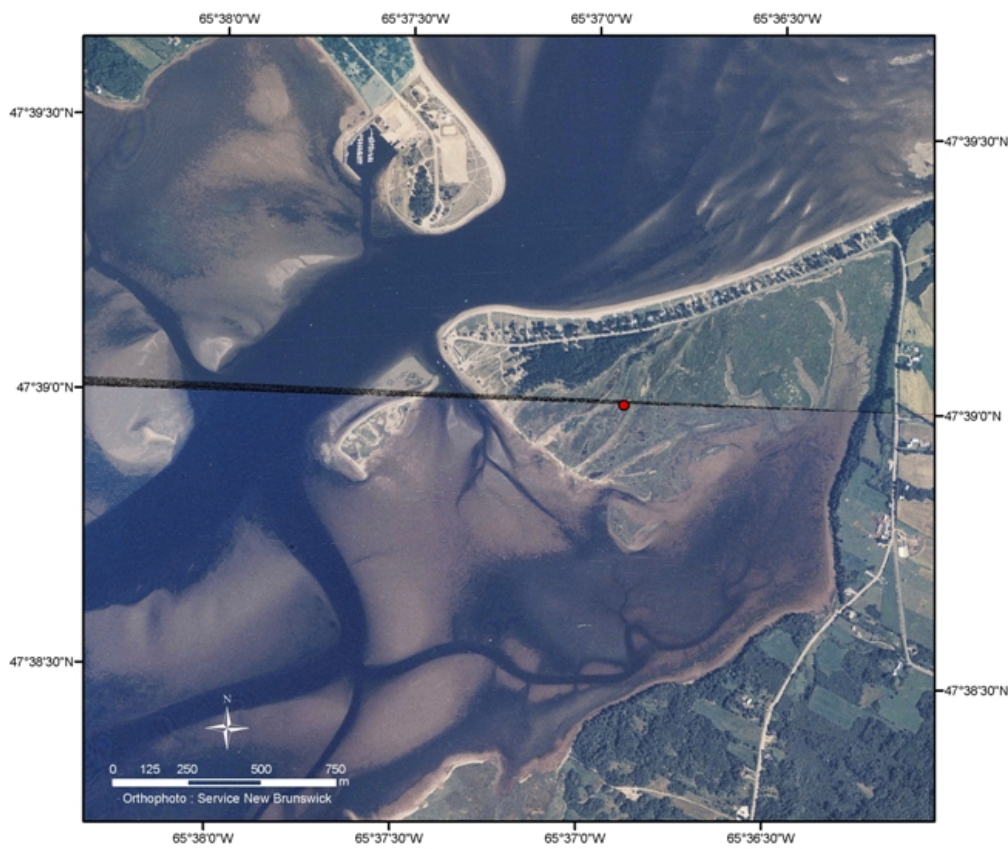
Figure A-6. Location of the site containing critical habitat at Carron Point. The dot (·) represents the approximate centre of the site. Within this site, critical habitat includes all suitable salt marsh habitat (as described in Section 7.1).