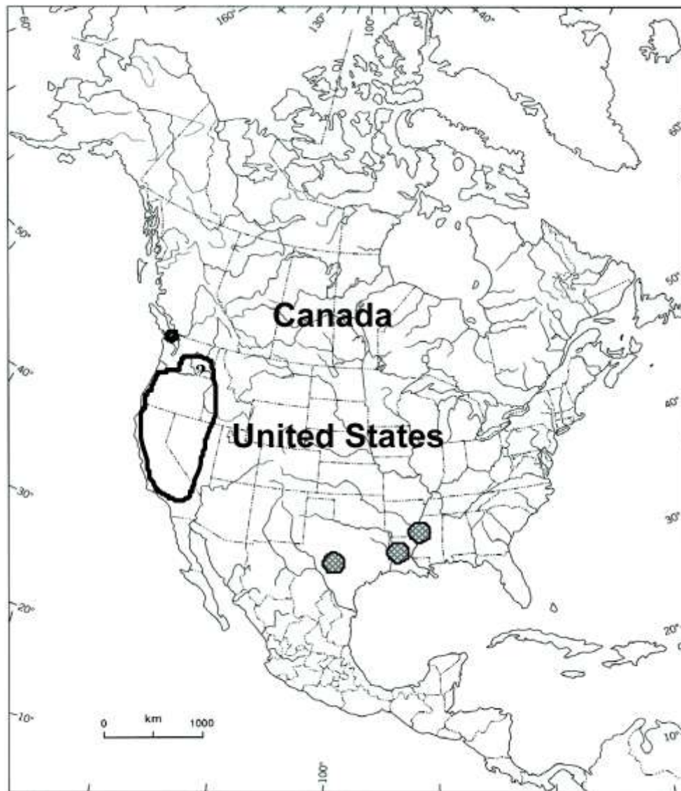
Figure 1. Distribution of Muhlenberg's Centaury in North America (from COSEWIC 2008). Possibly extirpated in Washington State and hatched circles are reported occurrences that are presumed to be incorrectly identified (COSEWIC 2008).