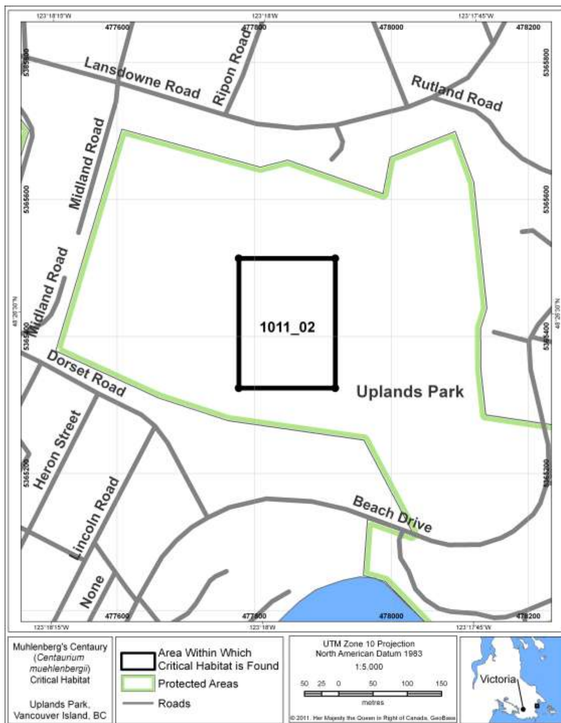
Figure 5. Area (~ 2.7 ha) within which critical habitat for Muhlenberg's Centaury is found in Uplands Park in Victoria and located on municipal park land. The area of critical habitat within this area is approximately 1.42 ha. The critical habitat parcel 1011_02 is bounded by a rectangle with the following corner coordinates: 477777, 5365324; 477777, 5365514; 477918, 5365514; and 477918, 5365324 (Zone 10 NAD 1983).