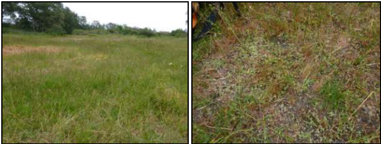
Figure 3. Habitat of Muhlenberg's Centaury at Uplands Park.

Given the broad ecological amplitude displayed by Muhlenberg's Centaury across its range and our currently limited understanding of its physiological needs, few generalizations can be made as to specific habitat requirements. In Canada, the species appears to thrive best in moisture-receiving sites that become wetted in the winter and dry out in summer. It appears to be intolerant of shade and may depend on periodic fire to maintain open habitat and limit competition.