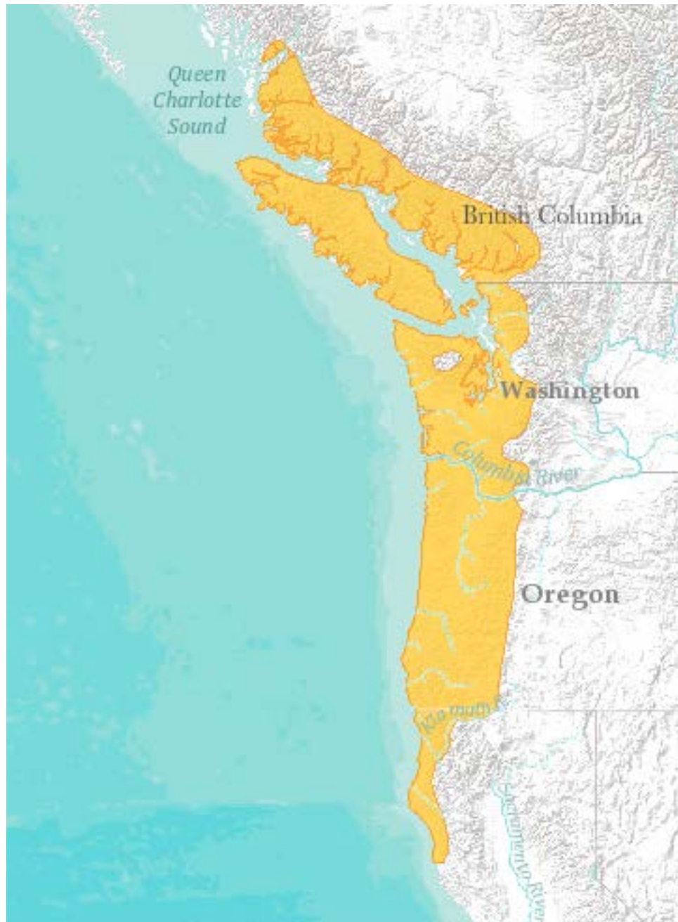
Figure 1. Range map showing global distribution of the Northern Red-legged Frog. Populations introduced to Haida Gwaii and Alaska are not shown.