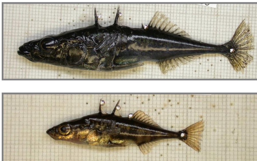
Figure 1. Photographs of Misty Lake Sticklebacks ( Gasterosteus aculeatus ) from the lake (top) and from the inlet stream (bottom).

The life history of the lentic and lotic forms is assumed to be similar. The life span of each of these forms has been estimated only from size-frequency plots. Fish from the inlet (lotic form) appear to live up to two years, whereas fish from the lake and outlet (lentic form) can reach three years of age. Within the entire system, breeding fish appear to be one to three years old, with the standard length of mature fish ranging from about 40 mm to more than 65 mm (Baker pers. comm. cited in COSEWIC 2006).