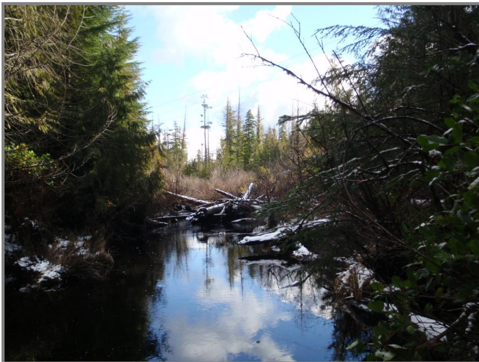
Photo 2: Misty Lake (lower) inlet stream taken from the intersection of the stream with Highway 19 looking south.