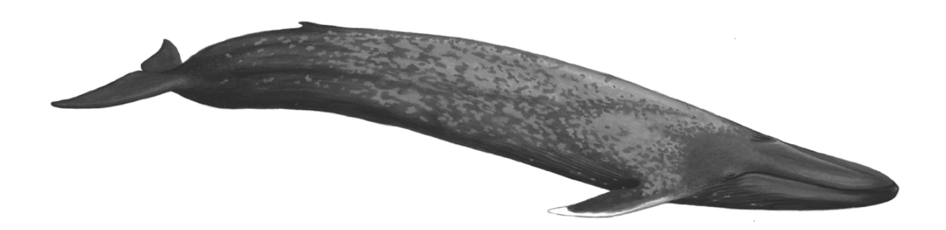
Figure 1. Blue Whale — Illustration by Daniel Grenier, courtesy of Mingan Islands Cetacean Study (MICS).

The blue whale is the largest animal known to have lived on Earth. Their weight varies between 73,000 and 136,000 kg (Sears, 2002; Sears and Calambokidis, 2002). Females are generally larger and longer than males and animals are larger on average in the southern hemisphere than in the northern hemisphere (Lockyer, 1984; Yochem and Leatherwood, 1985).