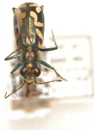
Figure 2. Dark Saltflat Tiger Beetle showing white hindwing markings. Specimen captured in 1996 at Manuel Canyon near Oliver and housed at Royal British Columbia Museum.

Dark Saltflat Tiger Beetles presumably live 2–3 years based on information from other tiger beetle life cycles (Pearson et al. 2006). Adults live for 3–4 months, during which time they mate and females lay up to 100 eggs individually within suitable substrate. Museum and collection records for Dark Saltflat Tiger Beetle in Canada indicate adult beetles have two activity periods: late May through June and again from mid-August to October. Tiger beetles with two activity periods tend to overwinter as adults, emerging in the early spring, during which time they forage, mate, and oviposit eggs into suitable substrates. Adults may then seek shelter and become less active and aestivate throughout the hot summer months, becoming more active again in the early fall. Some adults may also die-off during the hot summer. Tiger beetles active in the fall may have just pupated during mid-August. The adult fall activity period varies with the yearly weather, with longer warmer fall weather allowing for a longer adult activity period. These two