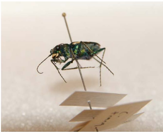
Figure 1. Dark Saltflat Tiger Beetle underside and white upper lip. Specimen captured in 1996 at Manuel Canyon near Oliver and housed at Royal British Columbia Museum.

Dark Saltflat Tiger Beetle (1.1–1.2 cm length) has bulbous eyes, a white upper lip, slender long antennae and legs, and prominent spear-like mandibles that extend and cross at the front of the head (Figure 1; COSEWIC 2009). The body colour (dorsal and ventral surfaces) of the head, legs, and midsection is an overall metallic bluish-green. Reddish-copper highlights occur on the dorsal surface only, in addition to a distinctive white pattern covering approximately 50% of the elytra (hardened front wings) (Figure 2). As the beetle ages, the whitish hairs along the area between their eyes and “lip” are broken off and no longer a good characteristic for identification (Acorn 2001).