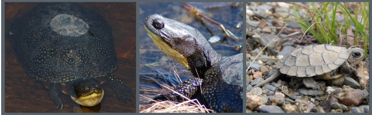
Figure 1 a) Adult female in the water b) Adult female basking with head up c) Newly hatched Blanding's turtle

Blanding's turtles are medium sized freshwater turtles with a semi-hinged shell. They are very long lived (80+ years) and, in Nova Scotia, slow to mature (approx. 20 years) (Congdon et al. 1993, Herman et al. 1999, McNeil 2002). One of their most distinctive features is the bright yellow chin and throat (Figure 1b). Their high-domed top shell (carapace) is grey to black with yellow flecks (Caverhill and Crowley, 2008). The flecks are typically brighter in younger turtles and most visible when the shell is wet (Figure 1a). The lower shell (plastron) is orange-yellow with irregular black patches. In juveniles, annual growth lines are visible on the lower shell (Figure 2). After turtles mature, the rings begin to wear off and the plastron eventually becomes smooth.