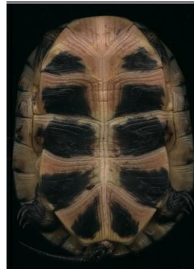
Figure 2. Bottom shell (plastron) of a juvenile Blanding's turtle, showing annual growth rings

In Nova Scotia, adult shell length ranges from 18 to 25 cm (Nova Scotia Blanding's turtle database 2010). Adult males are typically larger than females and can be distinguished by their concave plastron, thick tail base and solid grey upper lip. Newly emerged turtles, called hatchlings, are approximately 4cm long (the size of a toonie), and have uniform grey shells (Figure 1c).